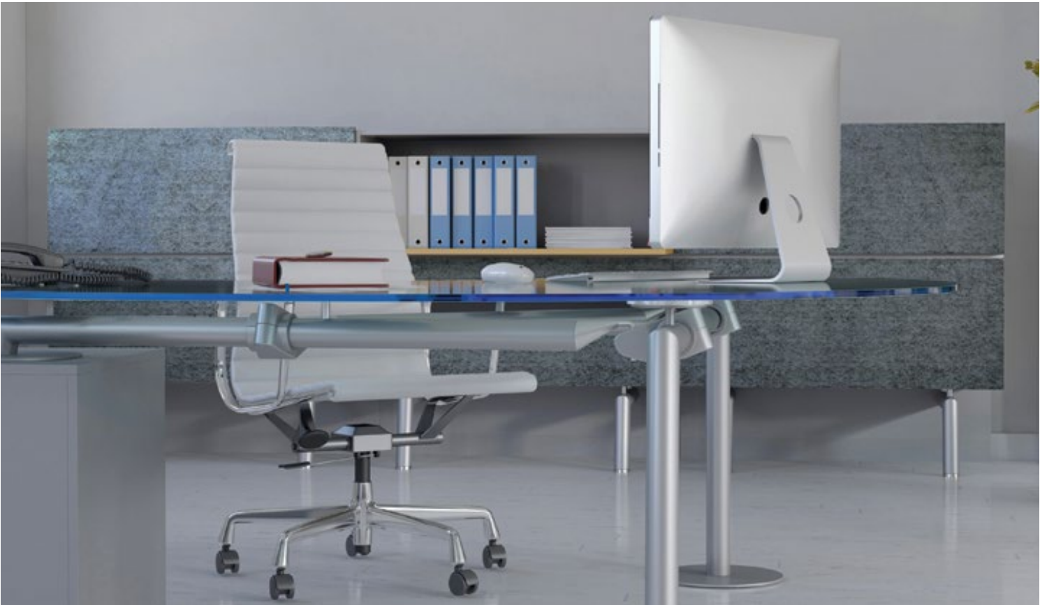
Zintra 1/8" Acoustic Panels wrapped panels in Dove