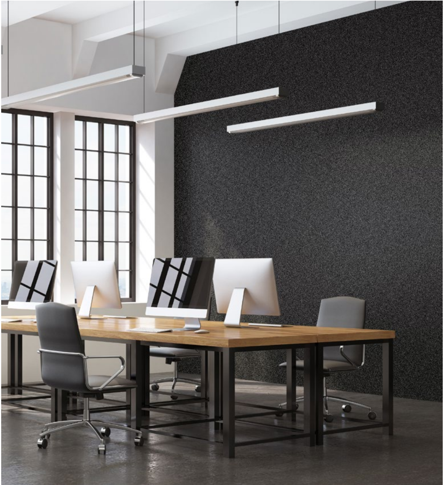
Zintrac 1/8" Acoustic Panels Charcoal