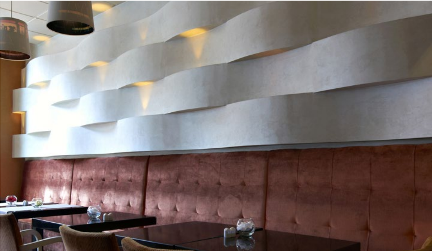
Zintra 1/8" Acoustic Panels Snow installed onto curved surface