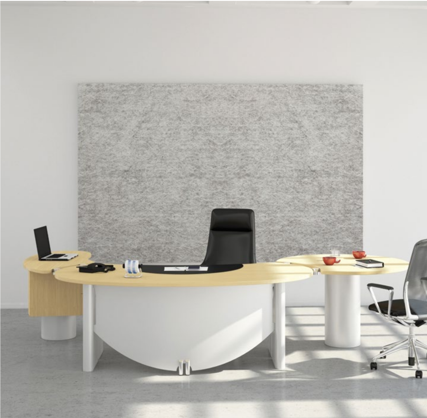
Zintra 1/8" Acoustic Panels wrapped panels in Cloud

Zintra 1/8" Acoustic Panels sheets are perfect for use as wrapped panels, on curved surfaces or as a seamless wallcovering for commercial, hospitality and institutional projects.